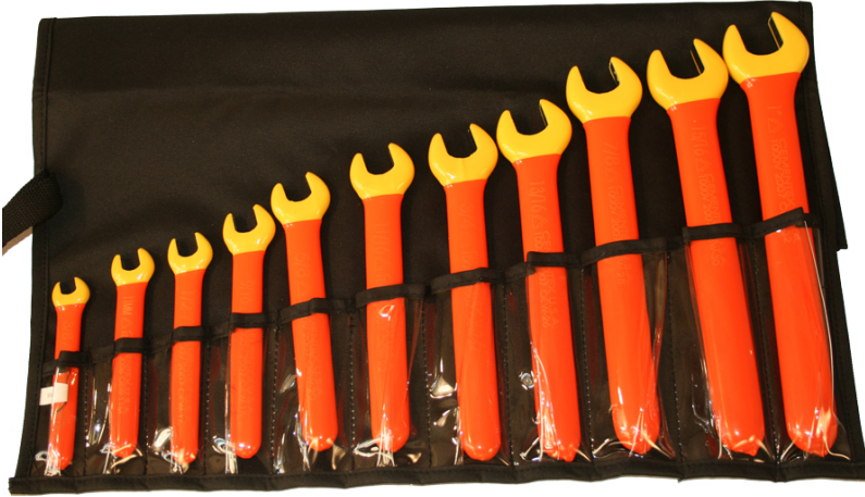
Photo is only meant to be representative of the IOEWS-13M kit.